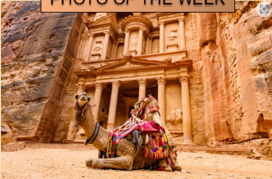
Al Khazneh (The Treasury), Petra, Jordan