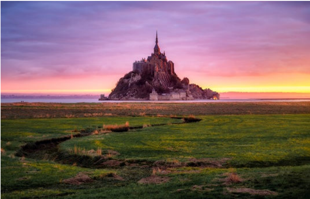
A view of Mont-Saint-Michel at sunrise