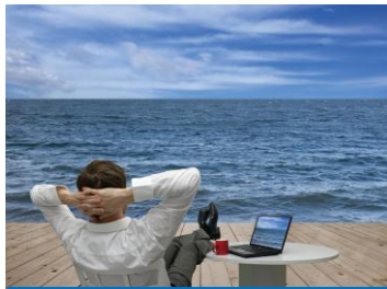
Wealth with tranquility is an optimal combination.

Wow. Money is almost as big an issue for teens as it is for their parents. The APA notes that the money stress for parents appears to spill over to their children. But conversely, "Young people learn a lot about healthy behaviors from watching and imitating adults, especially their parents." Getting your financial house in order is not only good for you, but also benefits your children, both now and in the future.