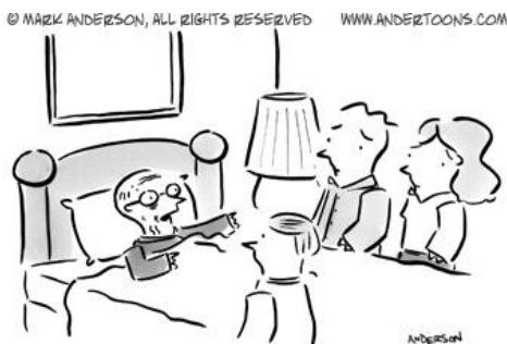
"I've lived every day like it was my last. And now that it's here, honestly, it's kind of anticlimactic."

Please include a list of special friends and family that you wish to be contacted in the event of your death. Include name, address, phone number and your relationship with these contacts.