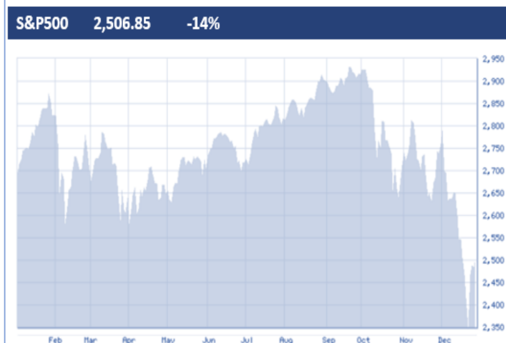
Chart Source: bigcharts.com