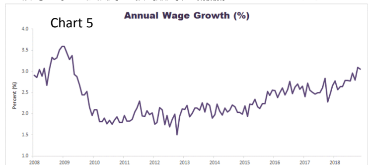
Chart 5 Annual Wage Growth (%)