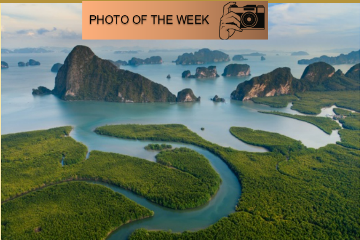
Limestone Karsts, Phang Nga Bay, Thailand