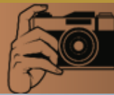
PHOTO OF THE WEEK

Riddle from last edition: I am in the center of gravity, and part of every victory. I am clearly seen in the midst of a river. I could name three who are in love with me and have three associates in vice. What am I? Answer: The letter V.