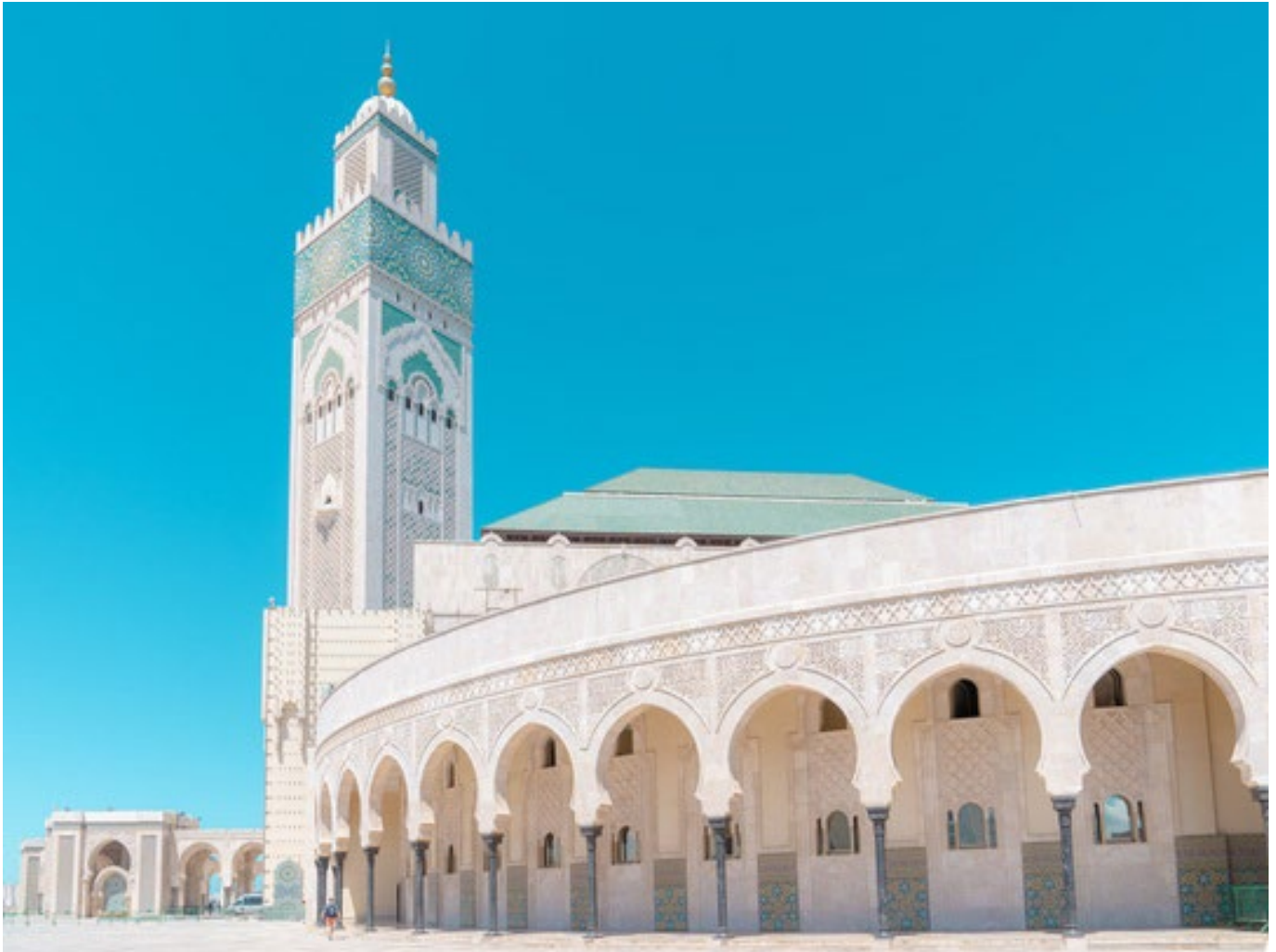
Hassan II Mosque in Casablanca, Morocco