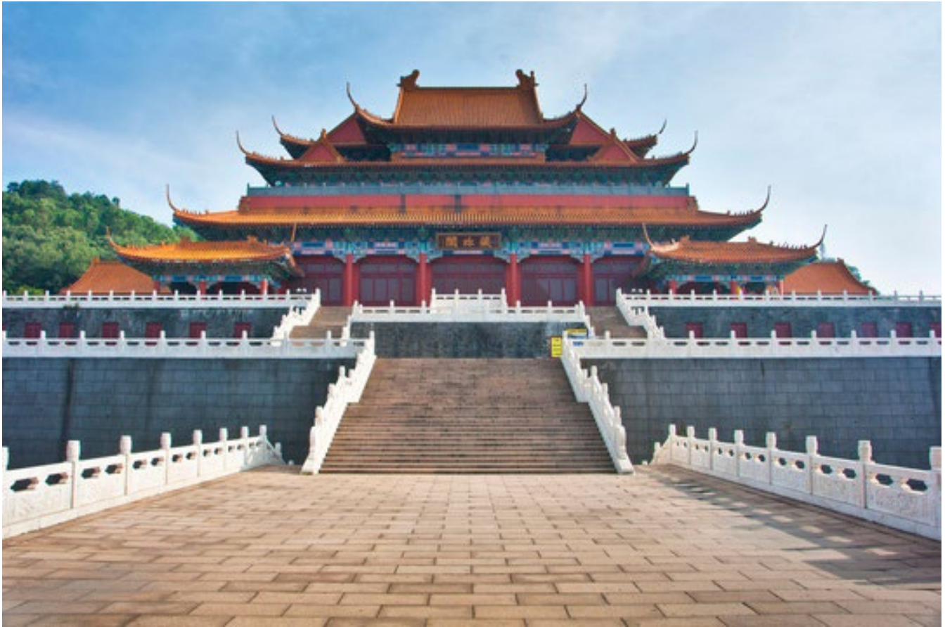
Forbidden City, Beijing, China