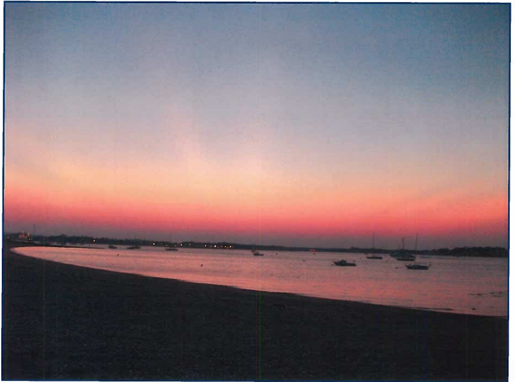
Sunset, Weymouth, Massachusetts