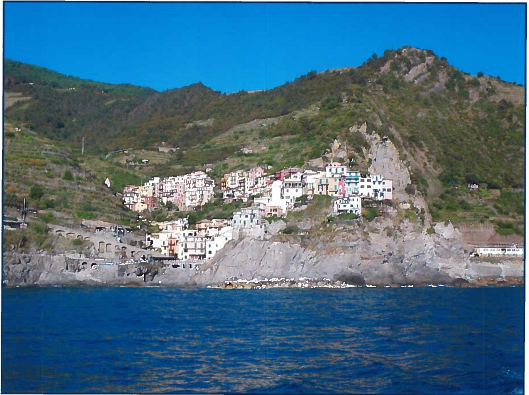
Town of Manarola, Italy