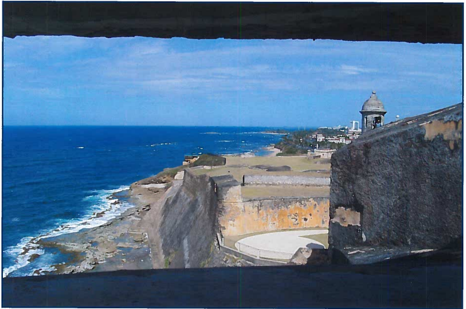
San Juan, Puerto Rico