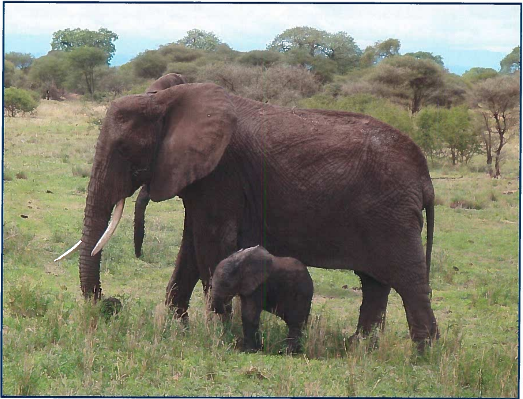
Elephants, Tanzania, Africa