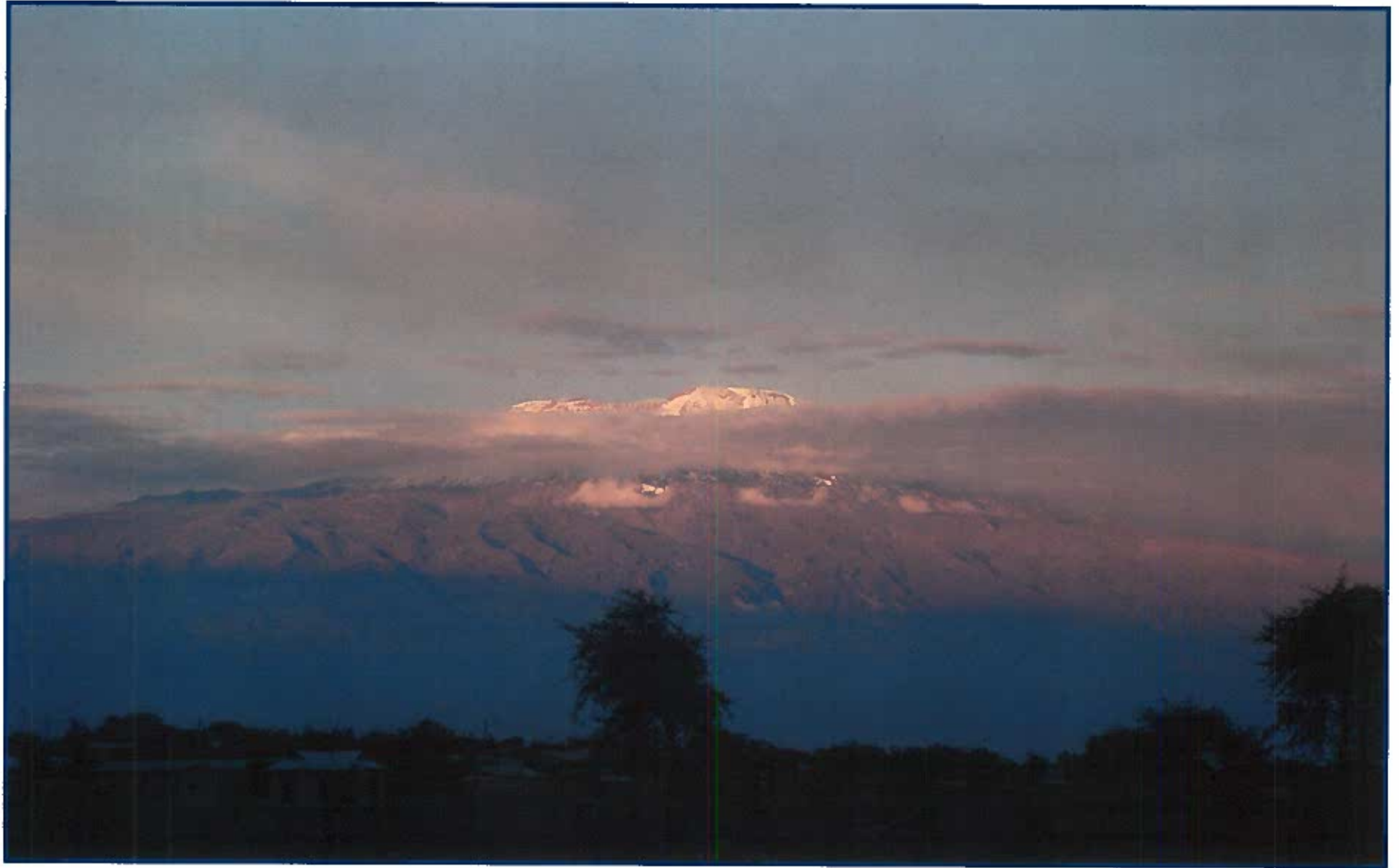
Mountains, Tanzania, Africa