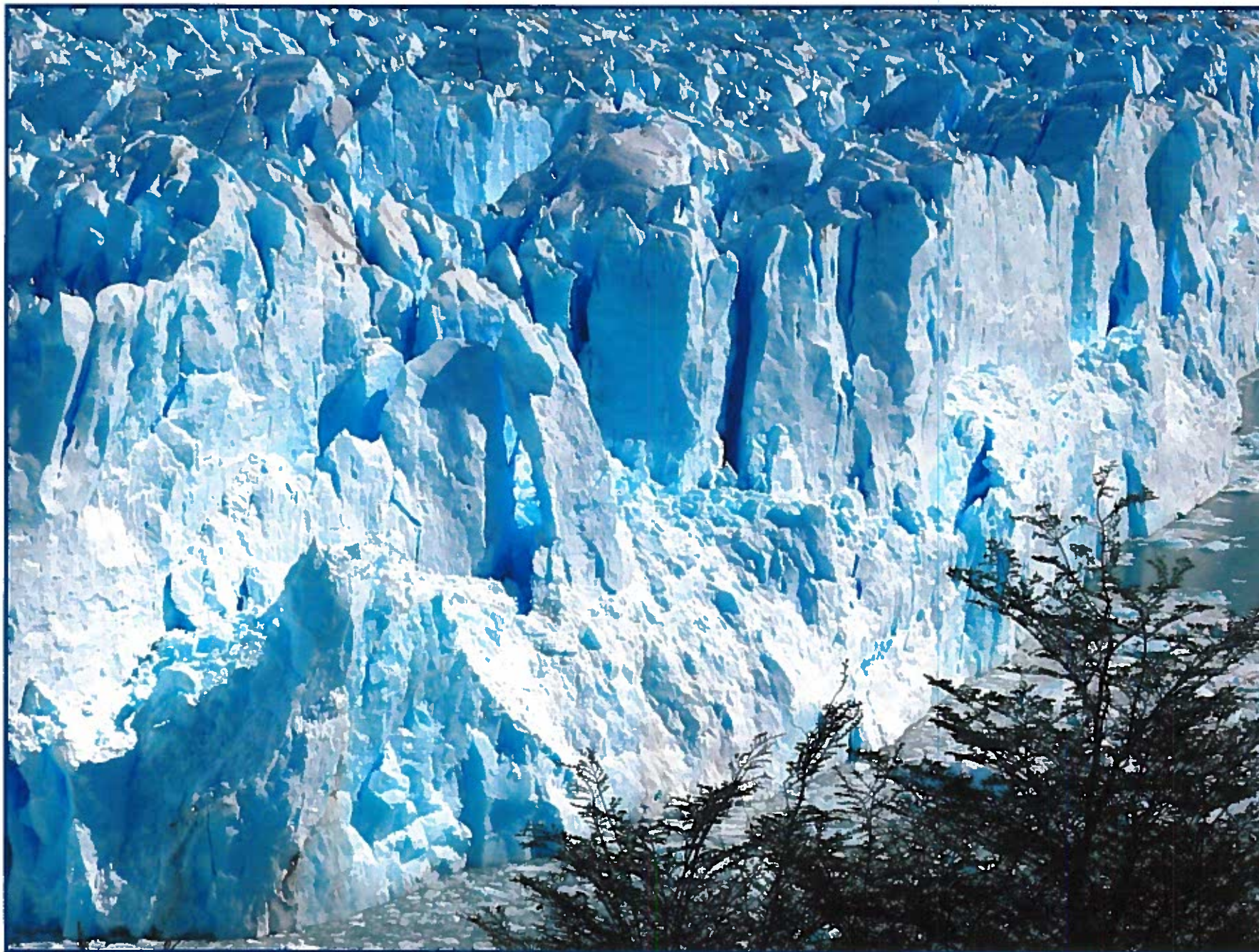
Glacier in Patagonia, Argentina