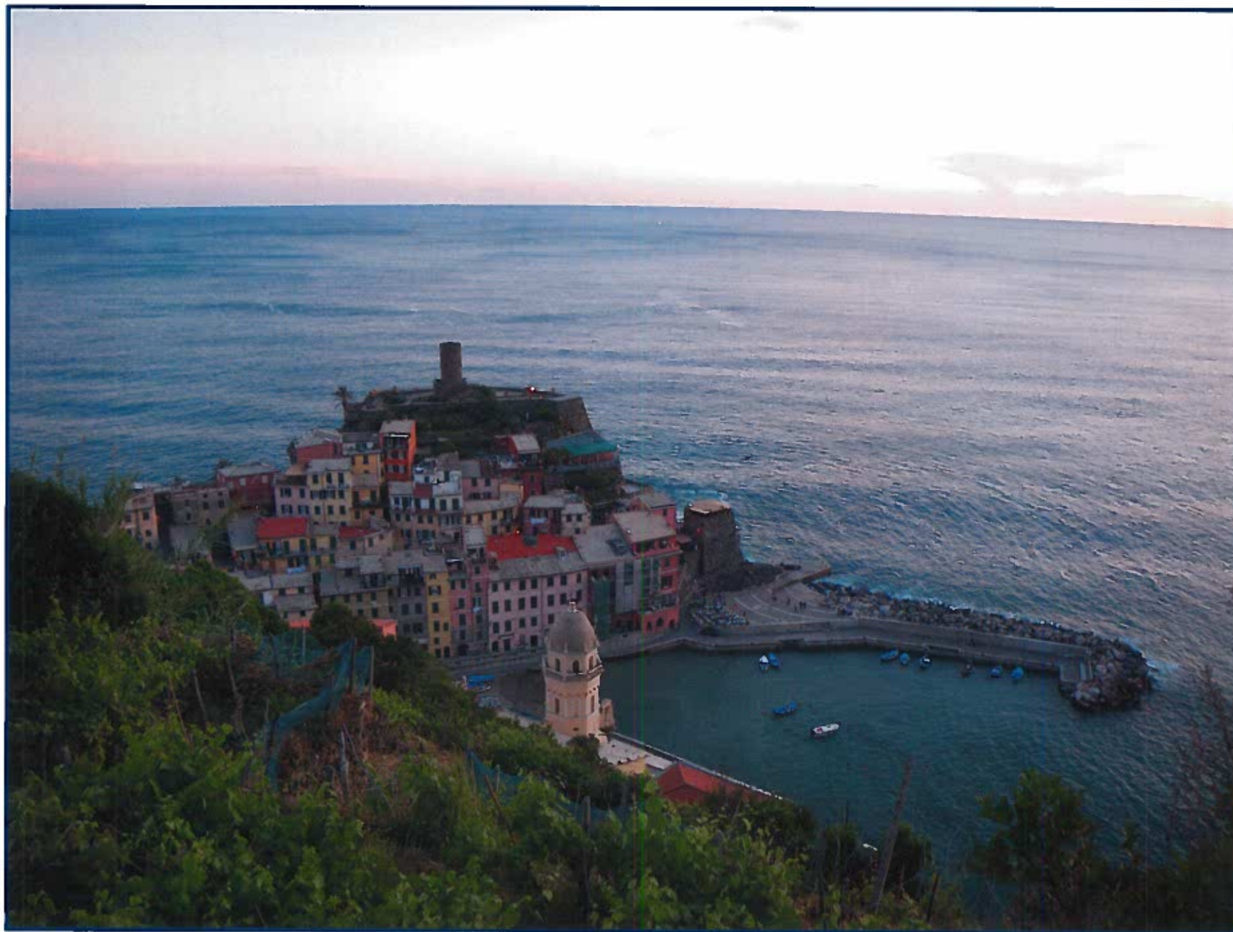
Town of Vernazza, Italy