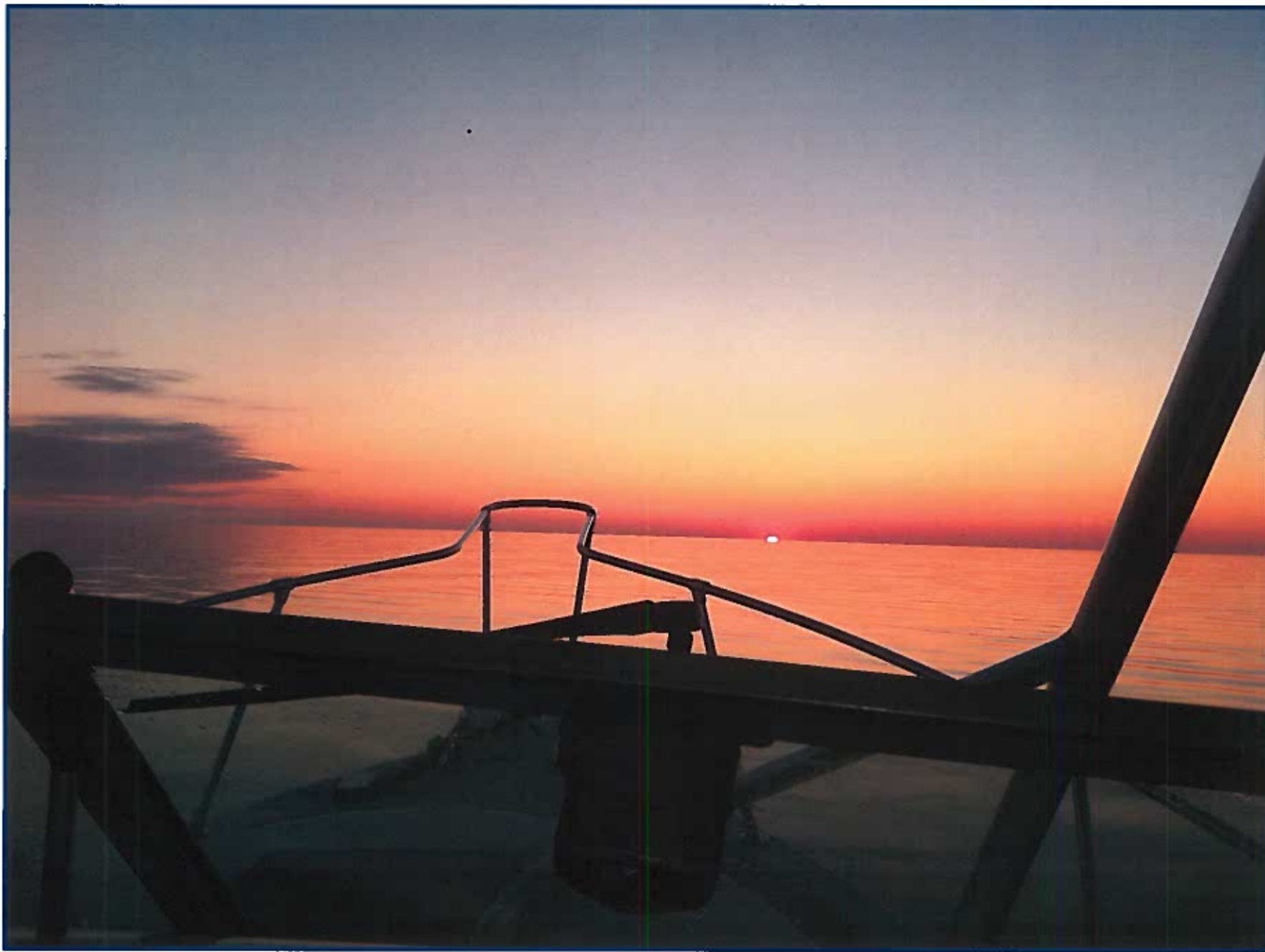
Cape Cod Bay, Massachusetts