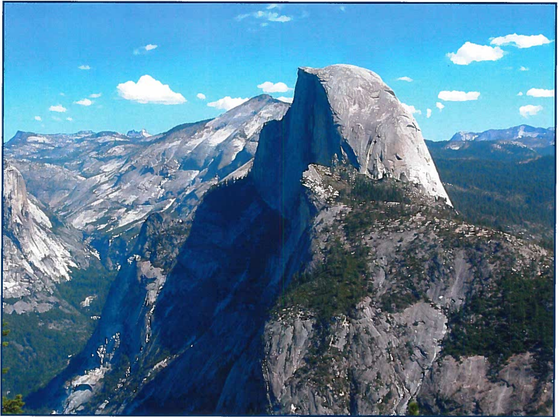
Half Dome, Yosemite, California