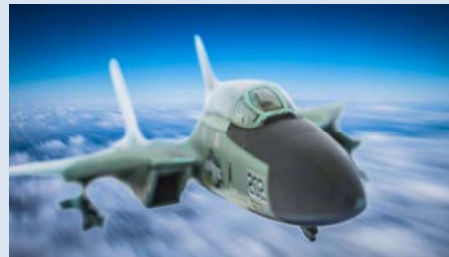
Like the swing-wing allowed an F-14 pilot to reconfigure his plane according to immediate circumstances, consumers might want to look for financial "engineering" features that allow for similar flexibility.

Compared to strapping a bigger engine on a plane's frame, the engineering that goes into building an aircraft with a swing-wing is a bit more complex. Similarly, integrating financial products – perhaps in varying proportions at different times – requires more thought and effort than simply establishing a new account and adding deposits. And regular "maintenance" reviews are essential. * * *