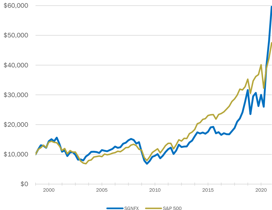
Growth of $10,000: Ending December 31, 2020

Philosophy: At the heart of the Sparrow Growth Fund investment is the belief that above average earnings per share growth creates shareholder value. Based on this fundamental principle, the fund is a highly diversified, multi-cap growth portfolio for investors who seek long-term capital appreciation