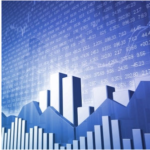
Chart reflects price changes, not total return. Because it does not include dividends or splits, it should not be used to benchmark performance of specific investments.