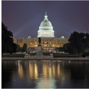
The SECURE Act may have the largest impact on retirement planning since the Pension Protection Act of 2006.