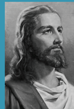
Jesus (Matthew 6:24)

"No one can serve two masters, for either he will hate the one and love the other, or he will be devoted to the one and despise the other. You cannot serve God and money."