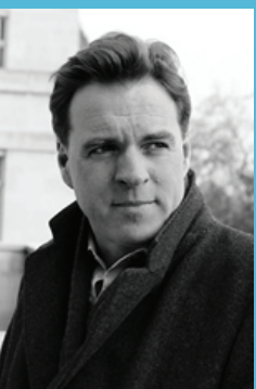
Nial Ferguson "The Ascent of Money"

"Money does not literally make the world go 'round. But it does make staggering quantities of people, goods, and services go around the world."