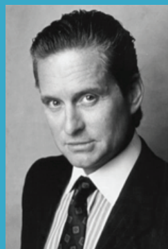
Gordon Gekko "Wall Street"

"Money itself isn't lost or gained-it's simply transferred from one perception to another. Like magic."