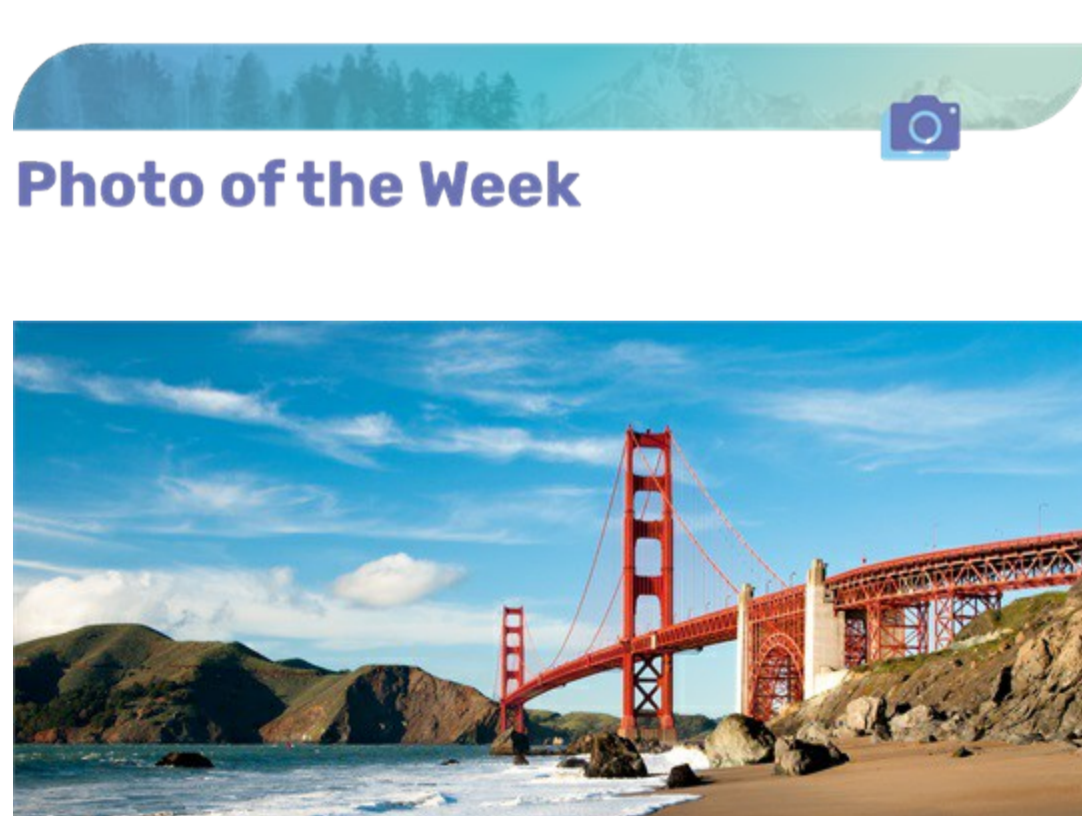
Golden Gate Bridge from Marshall Beach, San Francisco, California.