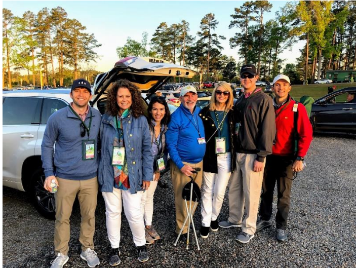
Parking lot at Augusta National