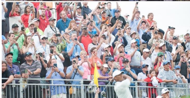
Tiger Woods before iPhones above, after below

The etiquette at The Masters is unreal. When it is time to be quiet it is truly quiet. No phones buzzing or pictures being snapped. The eyes are on the player and not the player