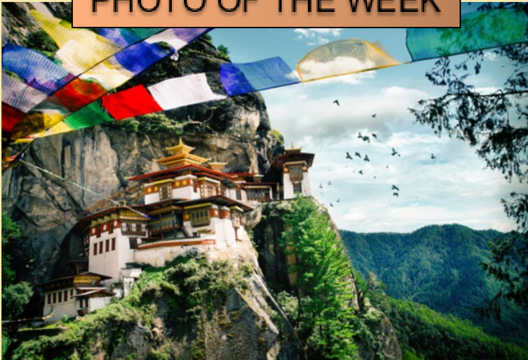
Taktshang (Tiger's Nest Monastery), Kingdom of Bhutan