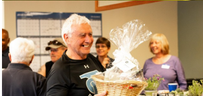
Clients enjoying themselves at this Summer's open house event