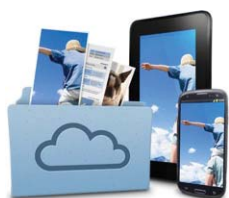
Photo back-up solution - Amazon Photos

Do you have thousands of pictures and videos on your iPhone, iPad, and computer, and are running out of space? Not only is running out of space an issue but also having confidence that the back-up service is actually doing its job! We've used them all, and we suggest Amazon photos, which gives you unlimited storage for photos if you are a Prime member. If you would like unlimited video back up, there is an additional fee for that.